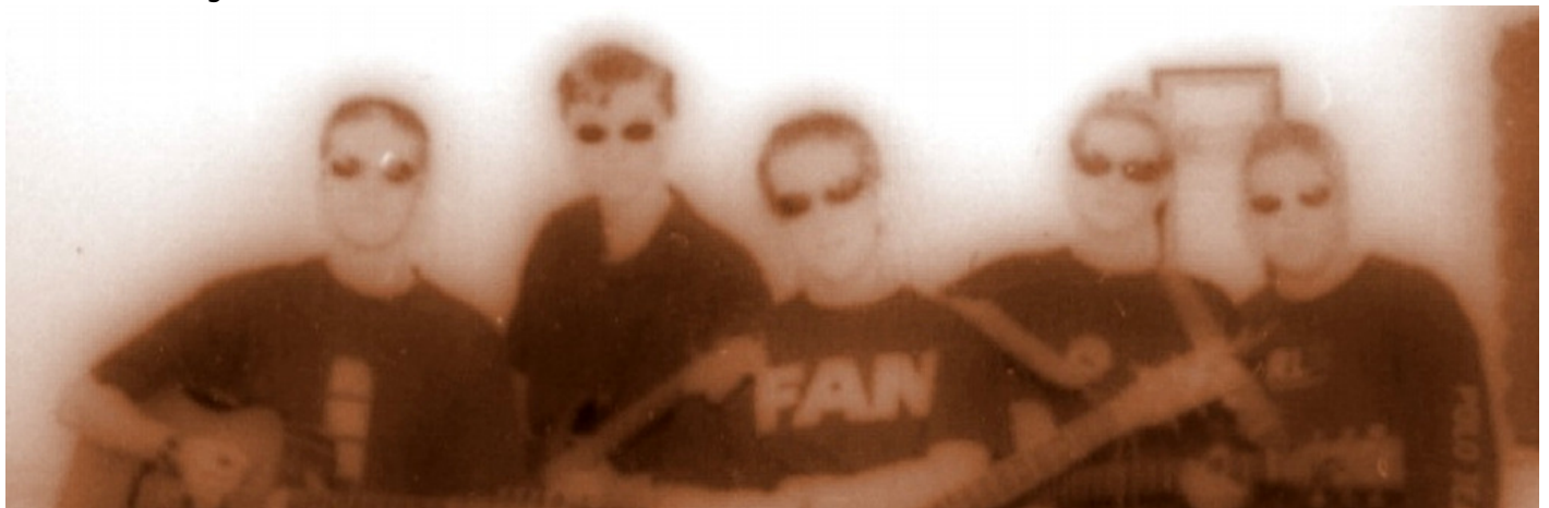
Darkstone Lightstone band in 2000

Darkstone Lightstone played Christian Rock with unintentional 1970s elements. The 1970s part is interesting. It came from two of our fathers.