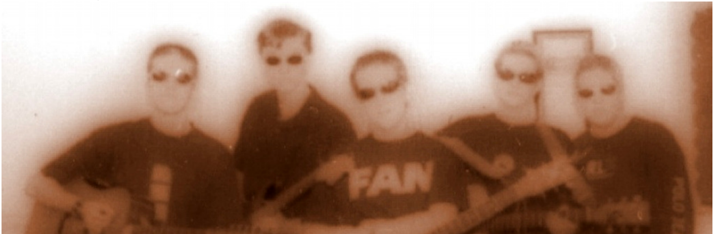
Darkstone Lightstone band in 2000

Darkstone Lightstone played Christian Rock with unintentional 1970s elements. The 1970s part is interesting. It came from two of our fathers.